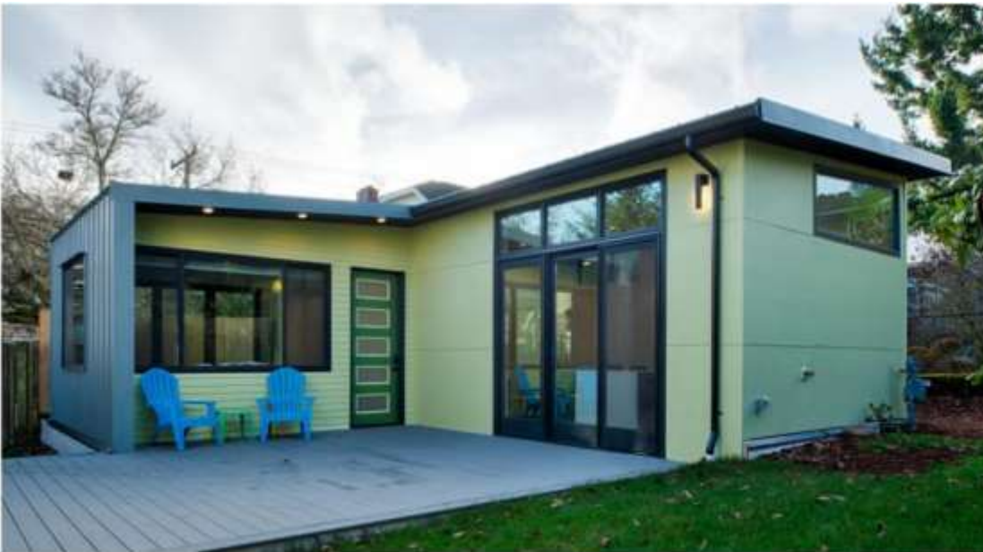
Smith Gillman Cottage converted garage. Credit: CAST architecture.